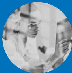
Biosimilars and Specialty Pharmaceuticals